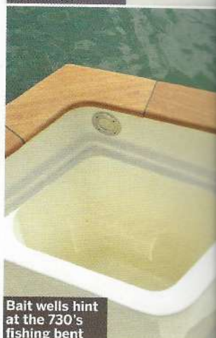
Bait wells hint at the 730's fishing bent