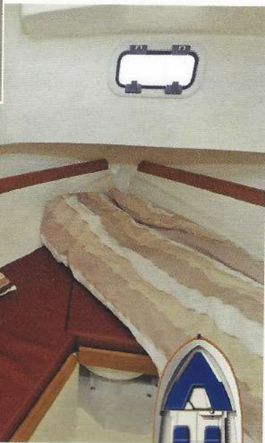
The cosy cabin is okay for the odd night