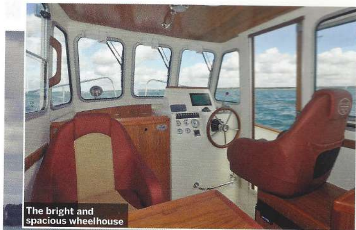
The bright and spacious wheelhouse

If the 730 had a face, there'd be a broad smile plastered across it