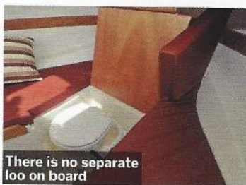
There is no separate loo on board

Length 25ft 9in (7.9m) Beam 9ft 8in (3m) Engines Single Nanni 205/230hp Top speed on trial 26 knots (230hp) Price from €85,500 inc 20% VAT Price as tested €123,545 inc 20% VAT